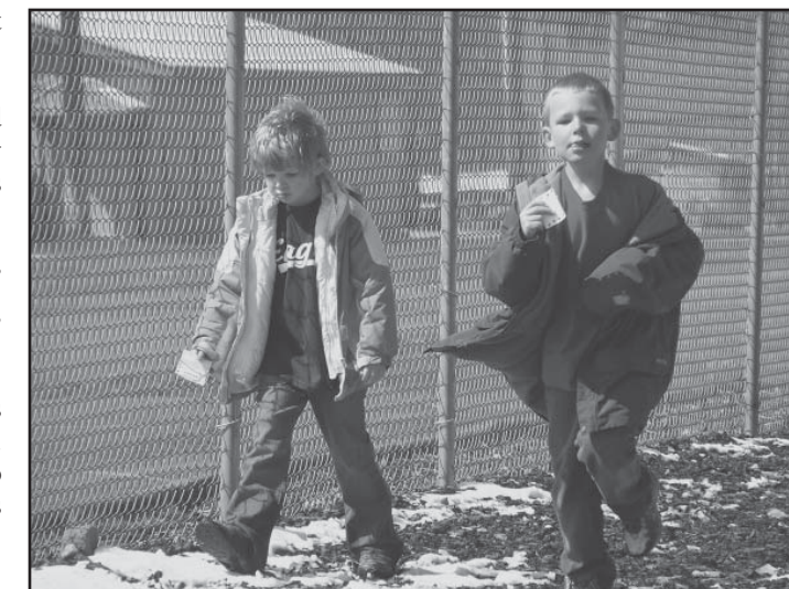
Two Joseph Elementary Mileage Club students stay fit at recess by making laps around the small Eastern Oregon school.