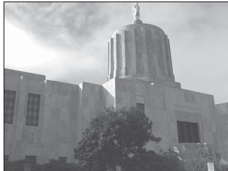
Oregon State Capital, Salem